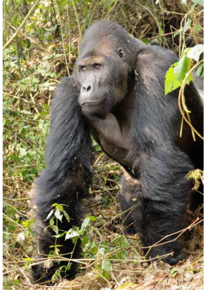
▲ Wild Grauer's gorilla in Eastern Democratic Republic of Congo